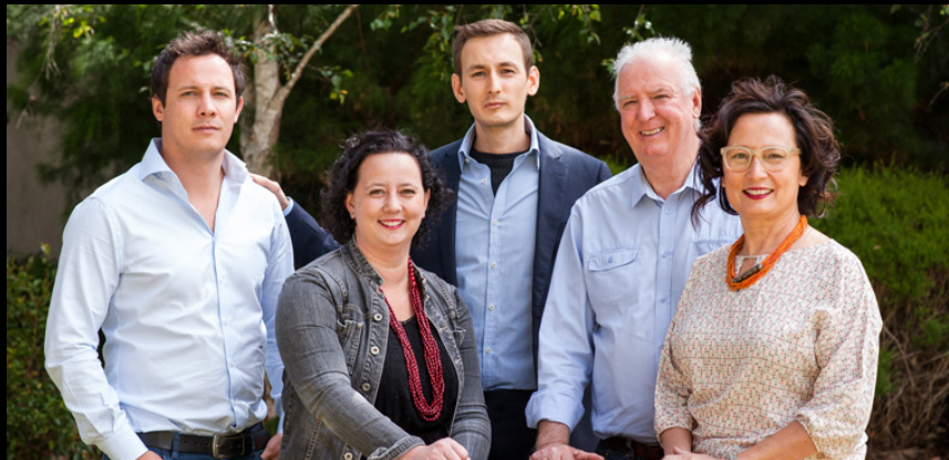
The Burch Family

For more information: www.burchfamilywines.com.au NZ Distributor: Eurovintage www.eurovintage.co.nz