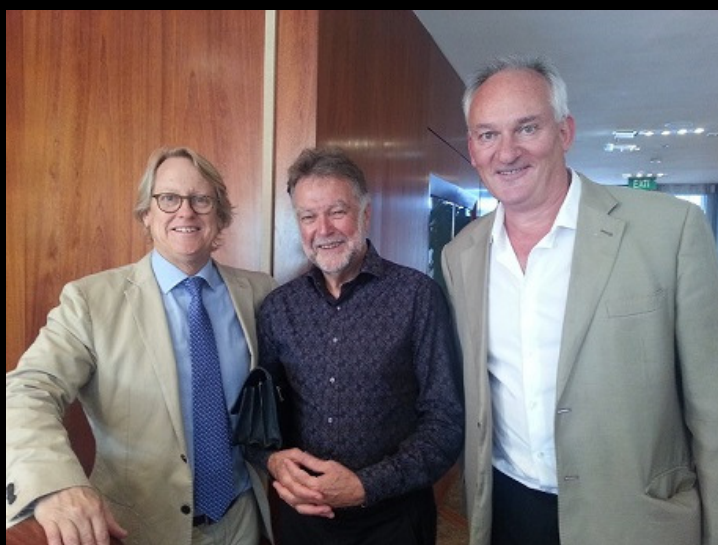
At the tasting in Auckland 21 st April 2015

NZ Distributor: Negotiants NZ www.negotiantsnz.com